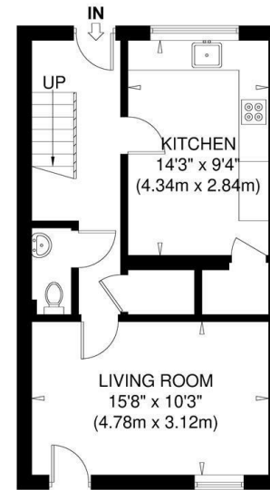
GROUND FLOOR GROSS INTERNAL FLOOR AREA 42.2 SQ M / 454 SQ FT